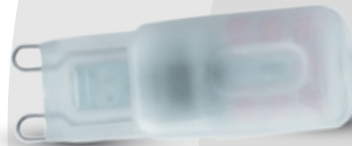
VT-203 ■ G9