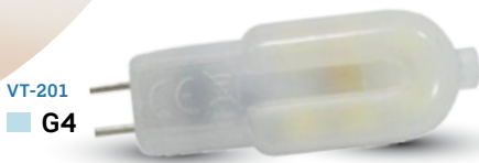
VT-201 ■ G4