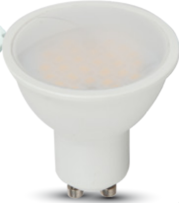
VT-205 ■ GU10