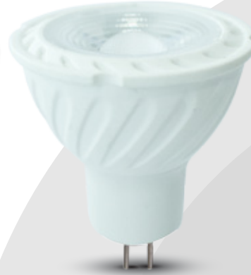
VT-257 ■ GU10