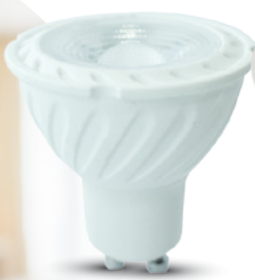
VT-277 ■ GU10